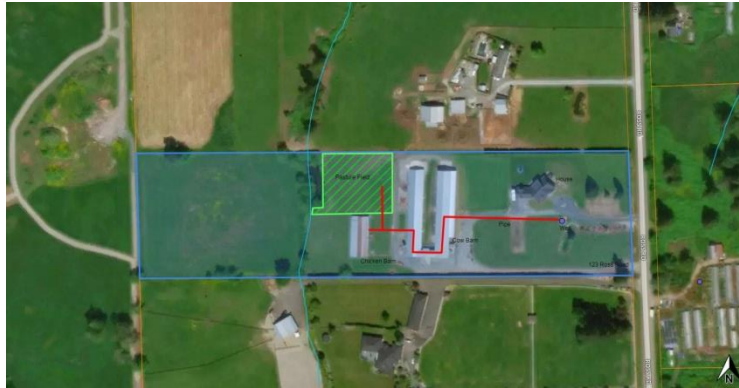
Figure 4: Second page of a report generated using the BC Agricultural Water Calculator for irrigation and livestock. The report features a user-made map that shows labelled well location, works (pipe), barns, house, and irrigated pasture field, as well as a map legend. The full generated report is a very useful addition to a water licence application.